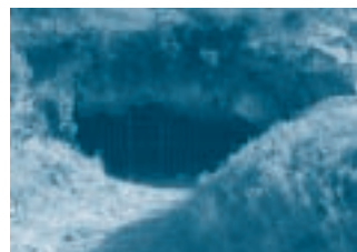
The entrance of the Nestani sinkhole